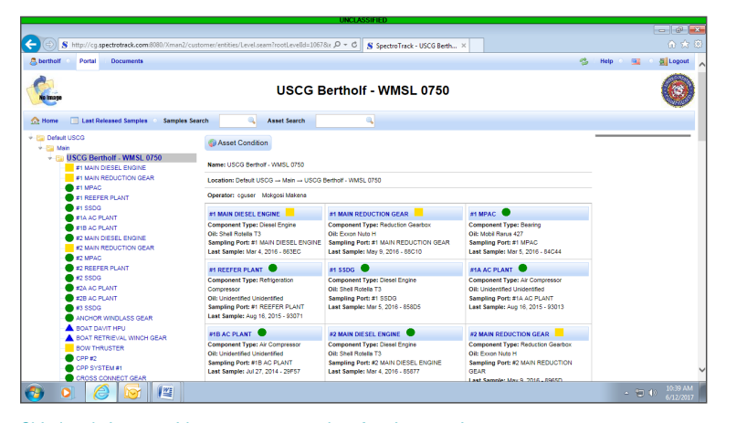
Ship level view provides access to results of various equipment

the Q1000 and Q3000 combo unit onboard one of the NSCs, the product line manager approved the switch to the combo unit."