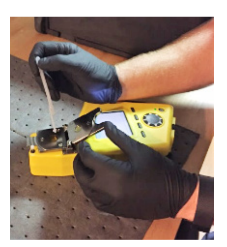
Inserting sample into Q1000 oil analyzer

"Through the centralized oil testing program and use of onboard analyzers, USCG now has complete ownership and visibility of all test data for the first time," Guevara said. "We have full confidence in our data which makes it possible to make decisions that improve our mission readiness and save money on unnecessary oil changes and maintenance. In several cases, onboard analyzers have identified potential problems so they could be corrected before equipment was damaged, which would have required expensive repairs and potentially put the cutters out of action. Using the Q1000 and Q3000 combo units, engineers onboard the NSCs can closely monitor increasing soot content in the engine oil as it moves towards the limit where an oil change is required. The Q1000 FluidScan is also used as a troubleshooting device to monitor water ingression in the reduction gears."